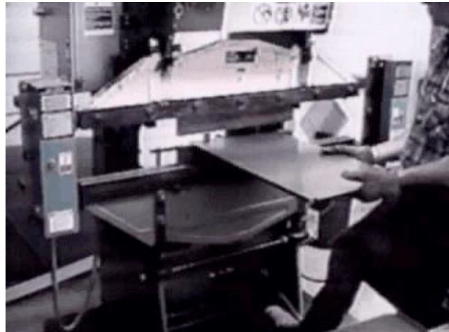
Press Brake Operation